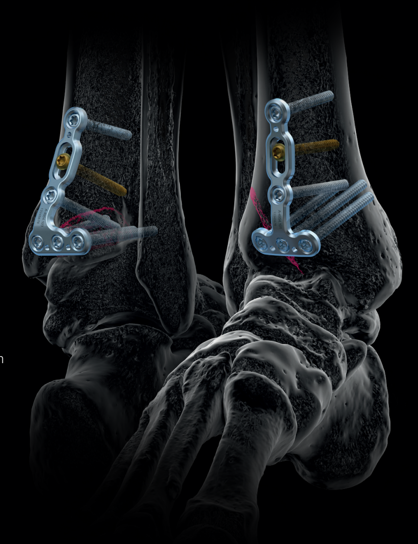
APTUS Ankle Trauma System