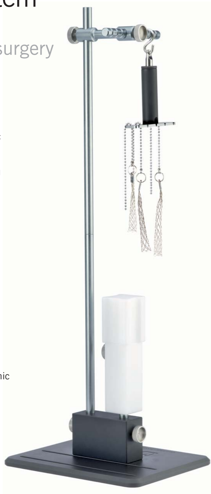
Art. No. A-9110