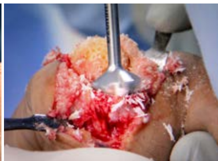
Reaming of cup reamer