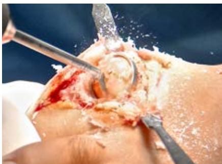
Reaming of cone reamer