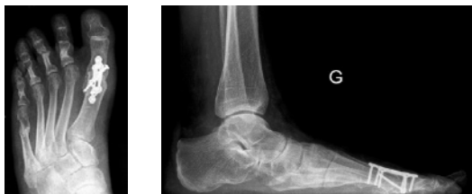
Figures 6–7: Postoperative WB X-rays at 4 months

At 4 months follow-up, the patient is satisfied with the MTP1 correction arthrodesis (valgus 12° - DF 22° - M1M2 5°). We advised the same surgery for the right side (M1P1 45°, M1M2 9°) without waiting for expected skin degradation.