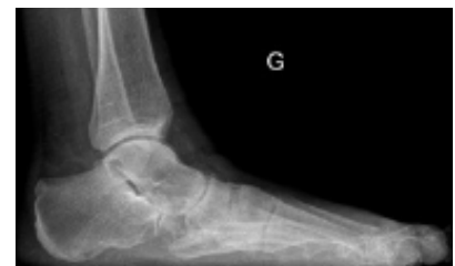
Figures 1–2: Preoperative AP WB view (left side: M1P1 60°, M1M2 10°, 234 toe lateral) and lateral WB view